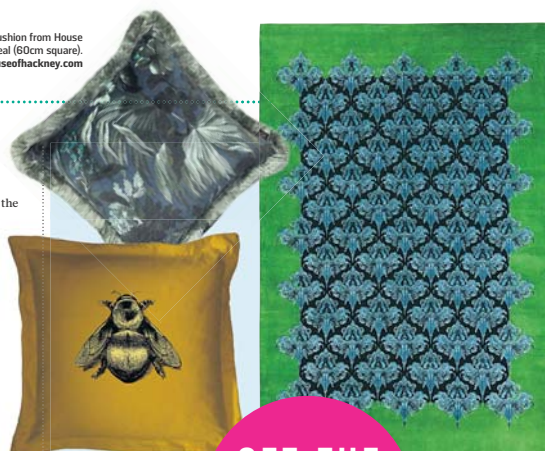
▲ Napoleon Bee velvet cushion by Timorous Beasties (65cm square). £108; timorousbeasties.com

"They know where to find that one piece that will bring it all together, just like a personal shopper." Great idea. Worth rolling out the red carpet for.