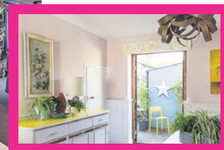
▲ This interior by Cork has walls painted in Farrow & Ball Calamine and a Butterfly pendant (£365; tomraffield.com)